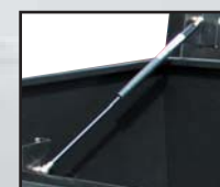
Hydraulic lift and lower