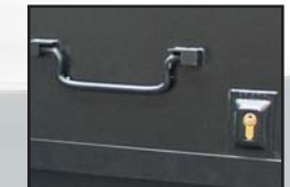
Drop down handles