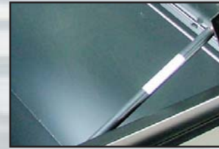
Hydraulic assisted lift and lower

The Senti range of Black Site and Vanboxes has built up a considerable reputation over the last 10 years from a standing start to being a leading, respected and recognised name throughout the industry at home and abroad. Our brand new range of Sentriboxes are now available for immediate delivery nationwide and have even more security features than ever before. These include anti-jimmy bars, hydraulic arms and a pair of double throw deadlocks operated by Eurocylinders on every box in our range. These locks are made to our own specification and are even better than the ones we have been using successfully over the last 10 years