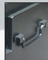
Drop down handles