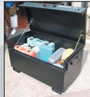
Hydraulic arms as standard