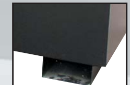
Forklift/pallet truck skids