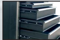
Ballbearing slide draws